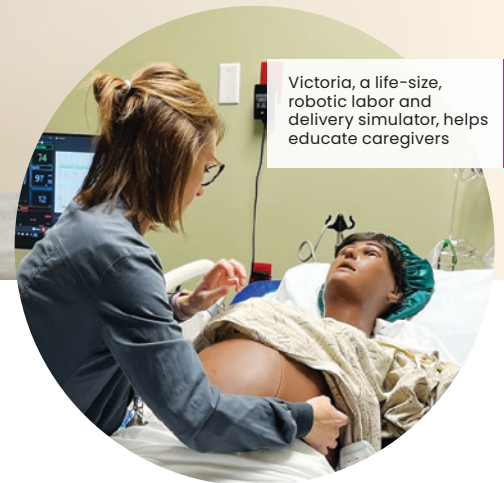
Victoria, a life-size, robotic labor and delivery simulator, helps educate caregivers