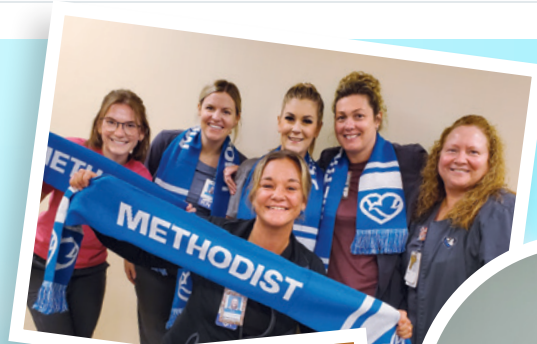
Showing our Methodist pride with this year's Caring Campaign gift!

Employee giving during Methodist Hospital Foundation's annual Caring Campaign is more than twice the national average year after year. Those funds support emergency financial assistance for employees and our greatest needs, including the expansion of Methodist Women's Hospital.